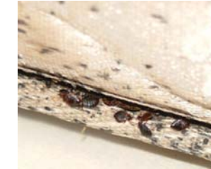
bed bugs in mattress

You must be very thorough in order to properly address bed bug infestations. As bed bugs can travel up to 30 m and can be transported in clothing, luggage or other household items, you may have to treat nearby rooms to prevent the infestation from continuing.