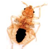
bed bug nymph

Newly hatched nymphs feed as soon as food is available. A bed bug goes through five moults before it reaches full maturity.