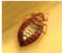
adult bed bug

In the past, insecticides such as DDT helped to keep the bed bug population at bay with residues that continued working after the product was sprayed. Now, with the increase in use of bait traps instead of broad spectrum sprays, specific pests such as ants and cockroaches are being targeted, and bed bugs are no longer being eliminated.